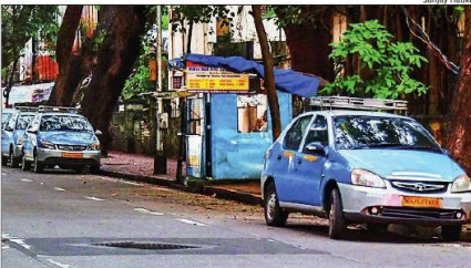
Taxi owners had petitioned the court against unauthorised parking

The RTA, Tardeo, in its Aug 7 reply said it had in Jan 2023 notified parking space for 20 taxis outside Dadar Post Office and 40 taxis in front of Kohinor Mills. But the Association, in its Aug 7 rejoinder, said only 10 cabs are allowed outside the PO in the taxi stand. It is facing the same problem near Kohinor Mills because of Assiad buses and illegal taxi operators. Despite regular complaints to the traffic police and RTA, except taking "some cosmetic action and doing lip service," nothing concrete was done.